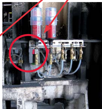
Labyrinth lubrication (2 points)