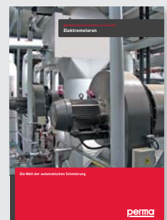
Electric motor lubrication (please refer to flyer)