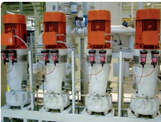
Lubrication system: 2 STAR CONTROL 120 cm 3 each