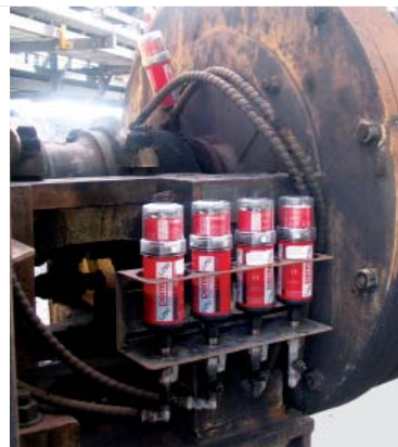
Lubrication system: 5 STAR VARIO 250 cm 3