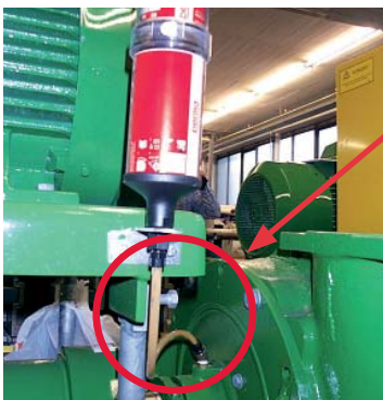
Gland lubrication (1 point)