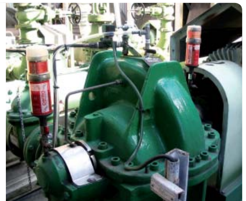
Lubrication system: 2 STAR VARIO 250 cm 3